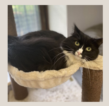
Longest Foster Cat: Julia In foster care since June 2018

Check out all of our adoptable pet profiles on our website!