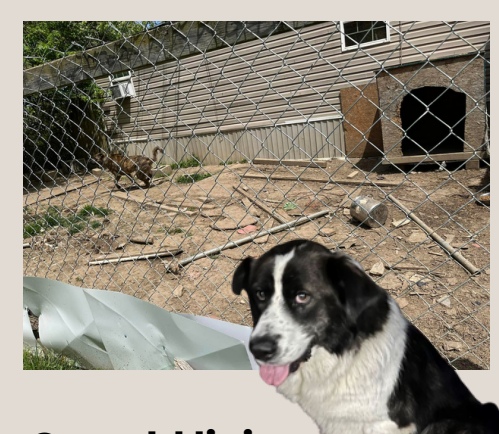
Crumbl living in squalor.