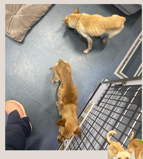
Willie and Nelson found abandoned and starved.

As most of our followers and supporters know, we are caretakers and TNR for community and feral cats. What you may not know is that we try to help other animals that reside at the same location. For example, we have rescued some dogs from living in squalor conditions and they have entered our adoption program. We have also collaborated with another organization to have 20 plus cats removed from a trailer where they were living in deplorable conditions. It took over 8 months and as it turned out, some of the cats removed were deceased by the time it was resolved. The person is legally not allowed to own anymore animals. In addition, the property next to this location was excavated for new builds and all the wildlife and other feral cats have made their way to the location, hungry and displaced. The residents don't want them there and this makes our efforts more difficult.