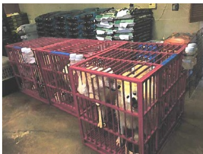
Both photos above: Dogs at Kabeara Kennels in Lockport, Illinois, were found in small cages with hardly any space to move. Some of them were in wire cages stacked three rows high. Yet due to minimal state kennel laws, the breeder was not cited for any violations. State inspectors took these photos while investigating a buyer complaint about a puppy with parvovirus.